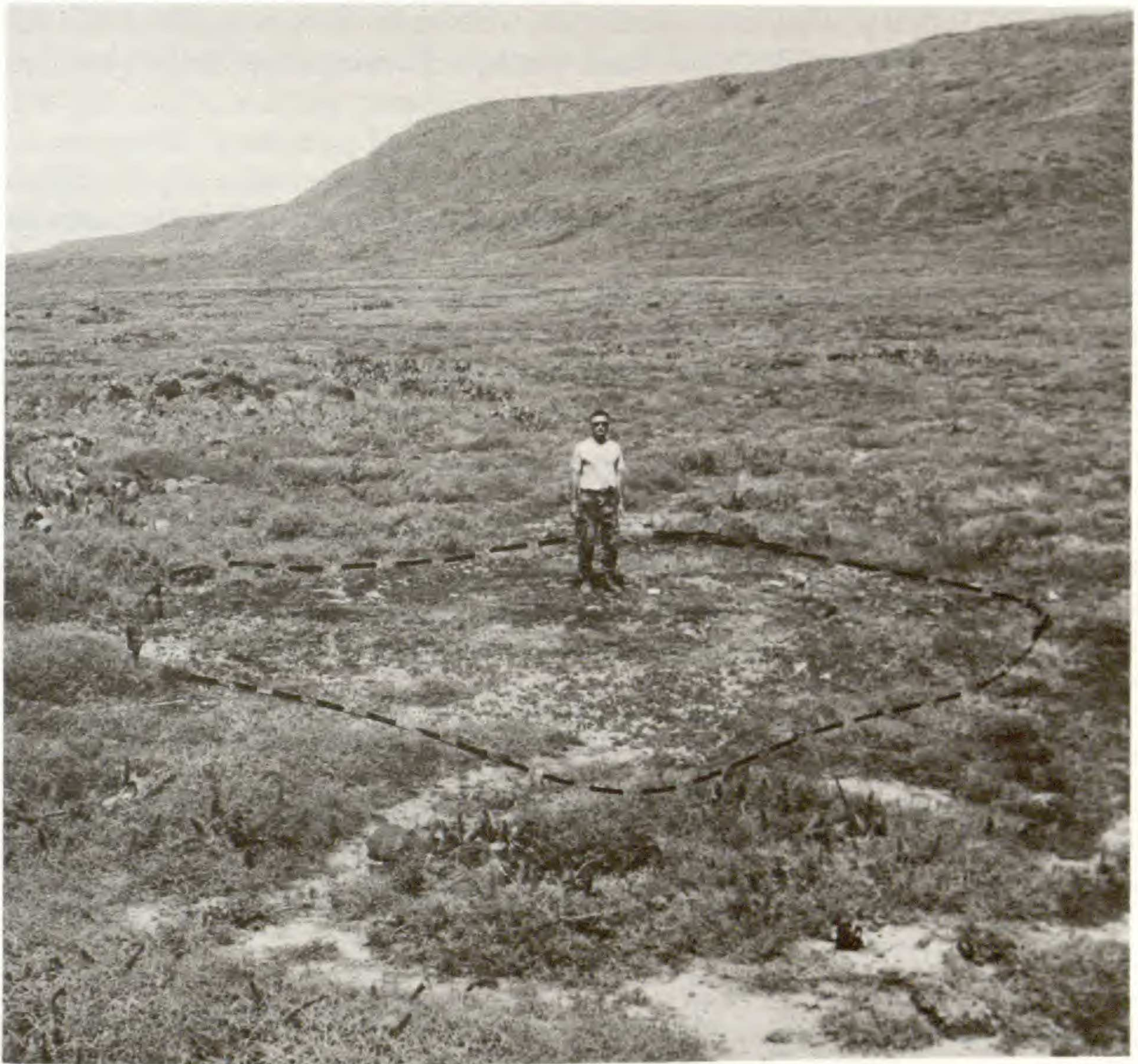
FIG. 2.—Midden sites on the west shore of San Clemente Island are characteristically small, spatially discrete shell middens. The broken line indicates limits of midden (site SA-61).

and SCII-1319 were selected for excavation because they appeared typical of hundreds of others in the area, and were comparatively easy to reach from an existing road. Both sites are black, ashy midden deposits containing abundant marine shell and burned rock deposits. All three sites were systematically tested with a soil auger, 10 cm in diameter, in order to estimate their subsurface character and extent. Based on the auger data, excavation units were placed to obtain samples of midden from the deepest to the shallowest portions of the deposits at a site.